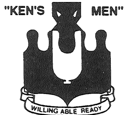
Hdqs & Hdqs Sqdn