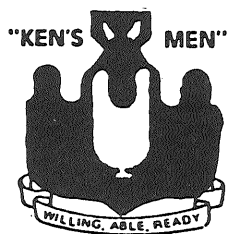
Hdqs & Hdqs Sqdn