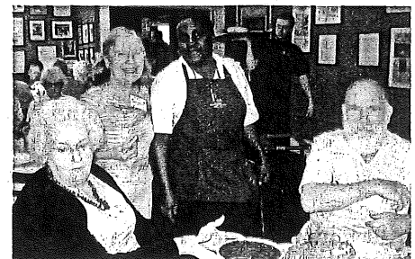
MARY MAC'S Tea Room